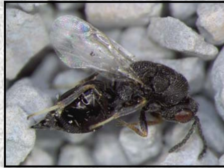
3 species of parasitoid wasps emerged from the gall of Walshia amorphella